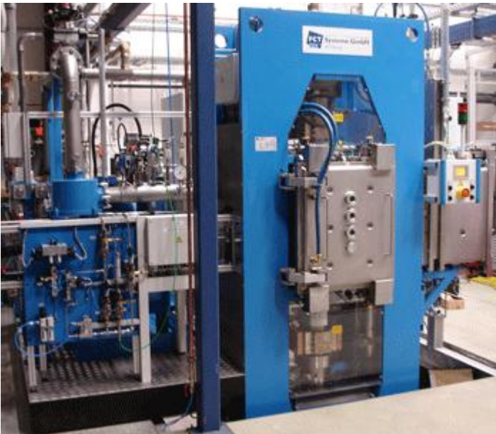
Fig. 3: Industrial furnace for FAST/SPS sintering

The development of ultra fast 'FAST 2 ' sintering technology for the production of small parts with a relatively simple geometry in high numbers is still in progress. The idea is to be able to sinter on-line with a powder press. FCT develops integrated press-and-sinter equipment which can sinter compacts in just seconds.