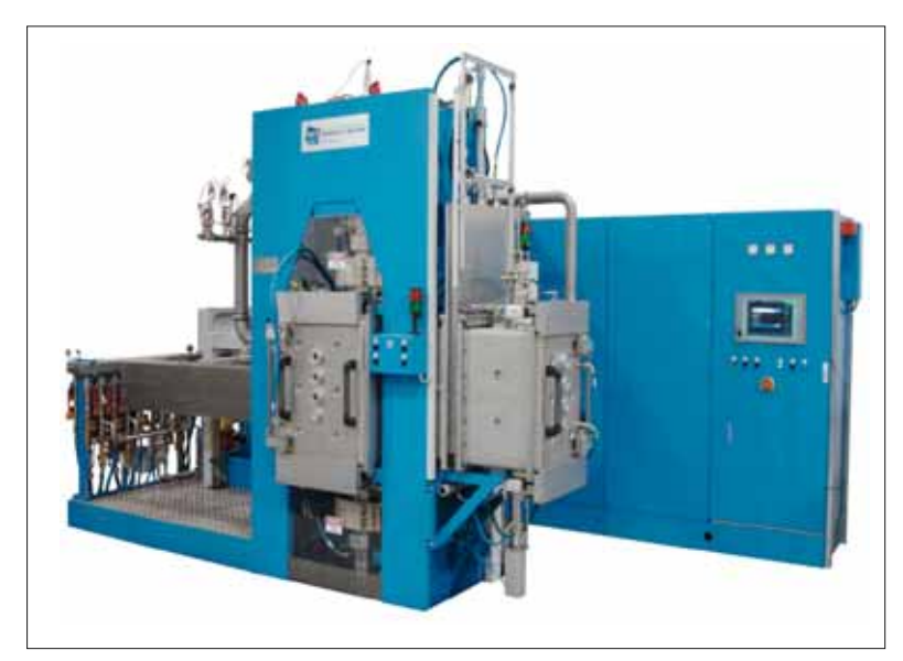
Fig. 1 FAST 2-chamber system (HP D 250/C)

Fig. 2 shows the result of an optimized SPS-process for WC targets with a diameter of 200 mm, with an